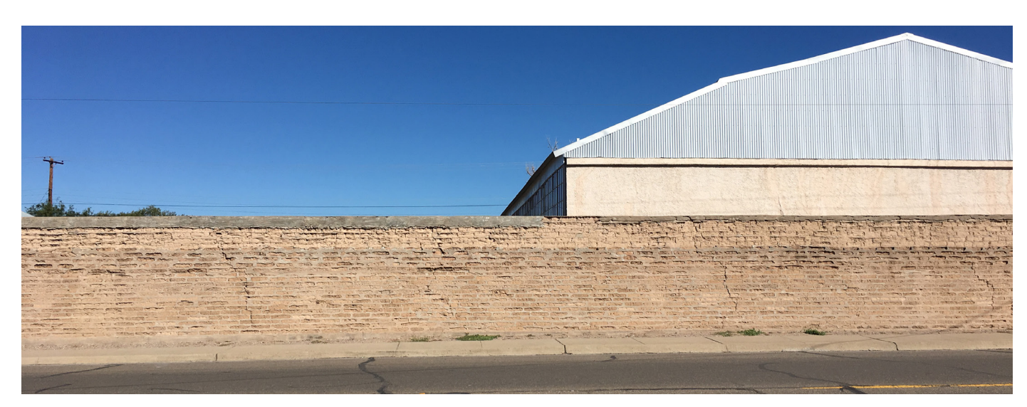
Figure 1: Donald Judd's compound "La Mansana de Chinati" ("The Block"), Marfa, TX.

For Judd, the walled compound operates as a spatial device that allowed him to retain a kind of dual status: A resident of a small west Texas town on the one hand, he brought with him the perspective and outlook of a cosmopolitan New York artist. (An outlook that included a library that at the time of his death had grown to over 13.000 volumes in multiple languages.) Only by maintaining a critical distance was Judd able to develop an artistic vision that ultimately drew deeply on the surrounding landscapes, yet processed these impressions through an intellectual frame of reference far beyond these landscapes. His enclave served as both a safeguard for his frame of reference as much as it became a testing ground for his artistic vision.