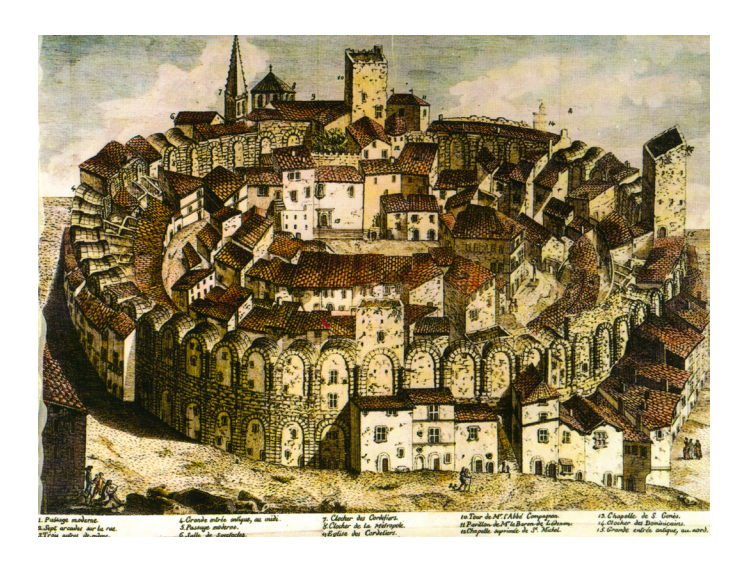
Figure 2: The medieval city of Arles (France) built into the Roman amphitheater.

"The City in the City – Berlin as Green Archipelago" was the outcome of the 1977 Cornell Summer Academy – a collaboration led by German architect O.M. Ungers with significant contributions by Ungers' former student Rem Koolhaas as well as 20 others.<sup>6</sup>