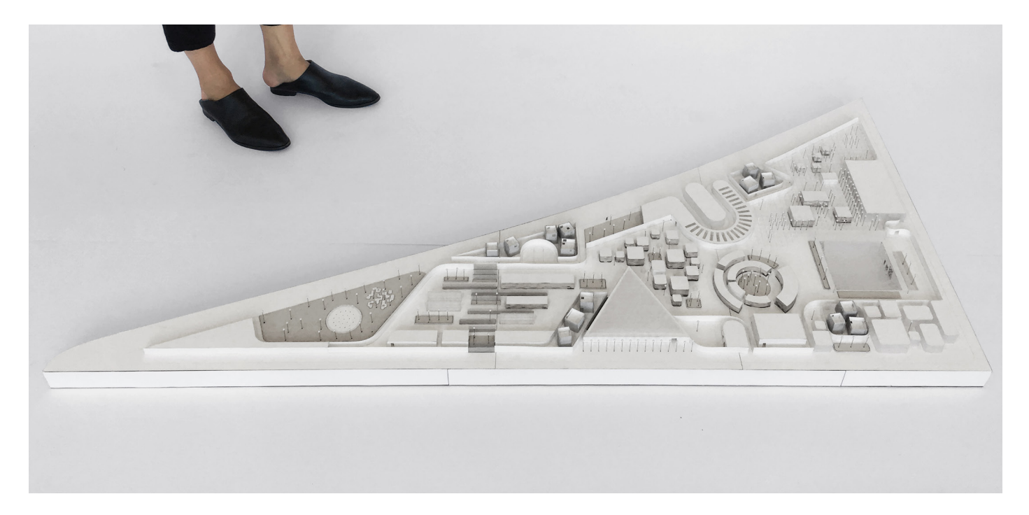
Figure 5: Project for an Urban Compound by A. Vanella, E. Wu (Advanced Design Studio Spring 2017, UT Austin, "The Urban Compound", Martin Hättasch, photo by A. Vanella, E. Wu / University of Texas at Austin.)

Lauded by Soane's contemporaries and historians for its mastery of classic geometries and compositional balance, the Tivoli corner's true achievement, however, may lie in its conceptual clarity: The absorption of the traditionally free standing architectural object of the temple into a new whole can be understood as a reflection of Soane's attitude towards an inclusive urban compound that is discrete, yet complex in its acknowledgement of external influences and internal conflicts. As such, the Bank of England and its architecture reflects changing, and at times contradictory, allegiances to ideas of form, function, the institution, and the city. In its very form are embedded the forces of Britain's modernization and the emergence of the modern financial sector in the 18th and 19th centuries: